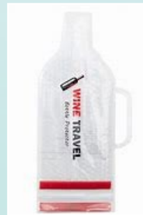
Plastic Resins Labeled #1-7 Plastic Pouches