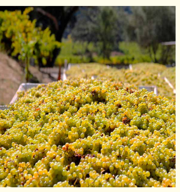
Ever-popular Chardonnay remains the number one winegrape variety in the state.