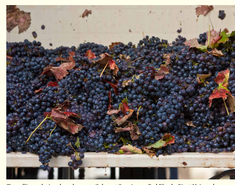
Top-selling red wines by volume are Cabernet Sauvignon, Red Blends, Pinot Noir and Merlot, according to Nielsen-measured U.S. off-premise sales.

"It was a compacted harvest for the Cabernet Sauvignon, coming in right on top of the large crop of Chardonnay, so tank space was at a premium," he continued. "Labor was tight, but we managed it by scheduling far in advance."