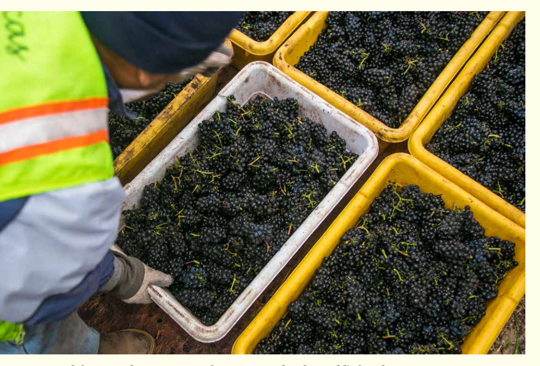
California makes 81 percent of U.S. wine and is the world's fourth largest wine producer.