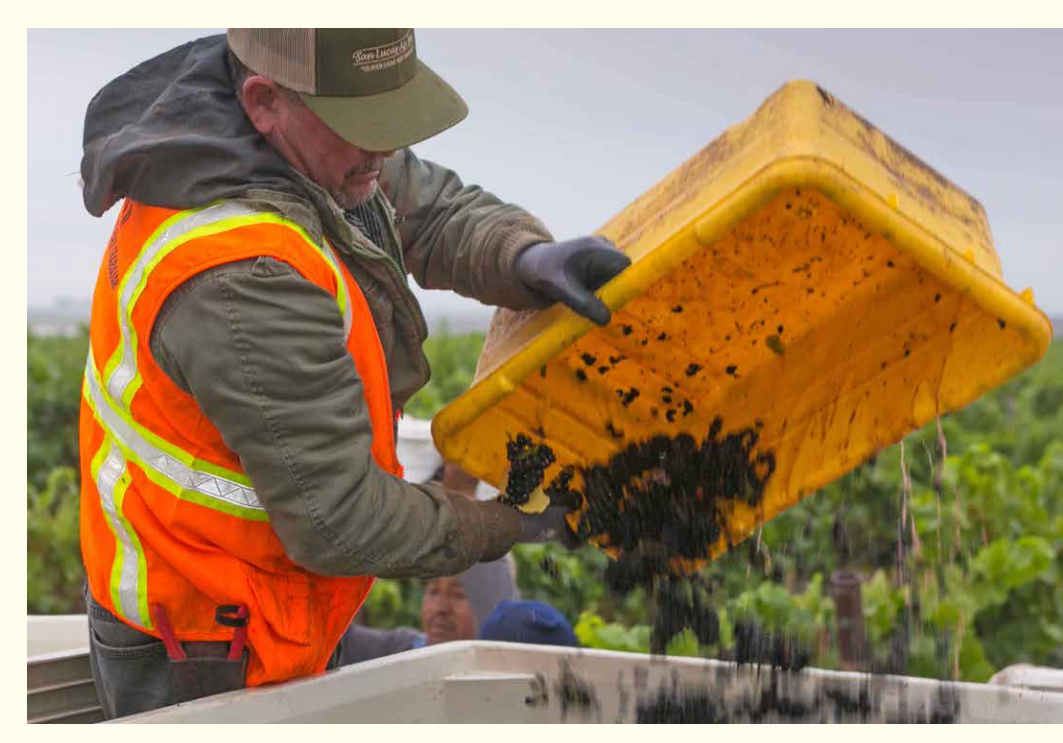
USDA estimated the winegrape crop in August at 4.1 million tons, slightly higher than the five-year historical average.

Growers reported "beautiful, steady conditions" for the 2018 growing season and harvest. Rain was abundant in February, and endless days of sunshine followed with the buds emerging from the dormant vines. Vines flowered uniformly, paving the way for even cluster development. The first picks of Chardonnay, Pinot Noir and Pinot Meunier began in mid-August. Sauvignon Blanc and Chardonnay were harvested without exposure to heat spikes or rain. Vintners experienced increased activity in October, as red varieties came in. Cabernet Sauvignon benefitted from warm days and cool nights, resulting in extended hang time. Growers are reporting strong yields compared to last year, along with complex flavors and excellent quality.